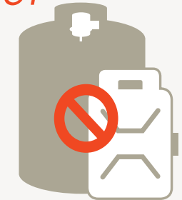
propane or fuel tanks