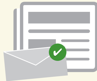
paper and newspaper