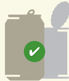
metal and cans