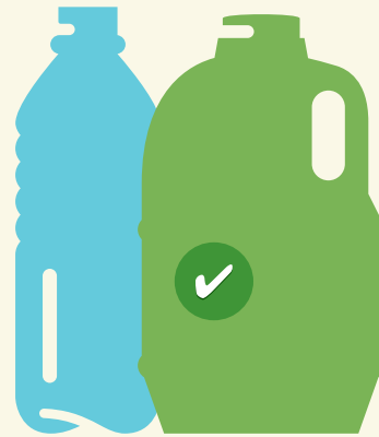
rigid plastics #1-7