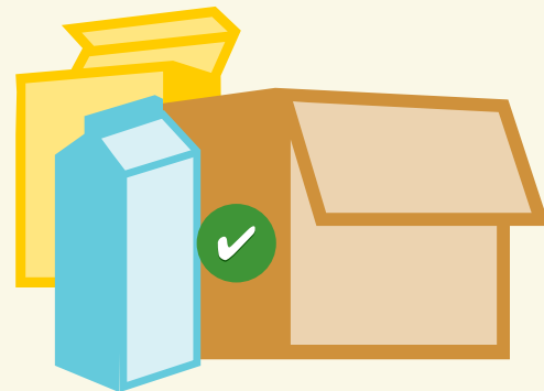
cardboard and cartons