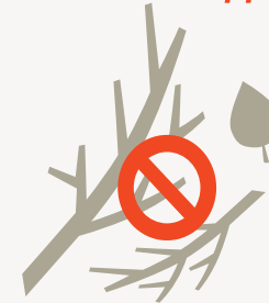
wood and yard clippings

PUT NON-RECYCLABLES IN THE TRASH OR COMPOST