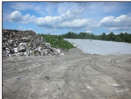
ecomaine's MSW storage berm

Based on the trial burning of the old MSW, ecomaine began a program in 2009 to store new MSW at the landfill for future use as a fuel. Two cells measuring 150 feet by 200 feet and protected with 13-foot high berms have been built solely for this purpose. During the summer months, when MSW is most abundant, some of it (unburned) is diverted here and covered with a paper residue that will keep it dry until it is burned at the waste-to-energy plant. Everything is used – even the paper residue is waste that has been recycled as a cover and will be re-used, later, as fuel for the waste-to-energy plant.