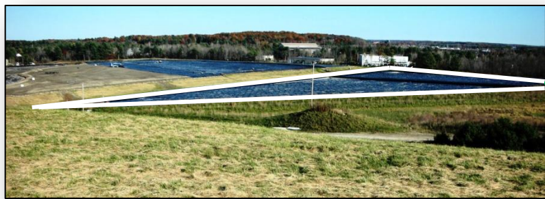
The seven-acre expansion cell (outlined in white) was constructed

What we call “the expansion area” is ecomaine 's newest ashfill area. The expansion was constructed in 2006 and first used in July, 2009. The seven-acre site was built with state-of-the-art environmental protection features at a cost of $6.8 million. The thick, black plastic covering – called a rain cap - was put in place in 2006 to keep out rainwater. The rain cap will be removed in pieces as more of the cell space is needed to bury ash from the waste-to-energy plant.