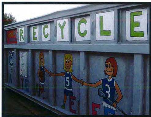
Yarmouth High LAX