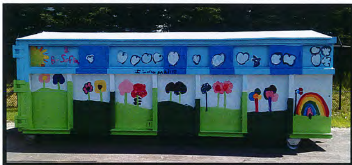
OneTree Learning Center, So. Portland