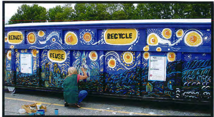
Readfield Elementary School