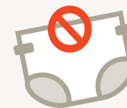
diapers or pet litter