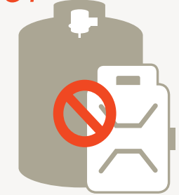
propane or fuel tanks